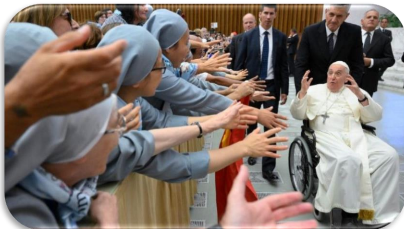
Pope Francis greets participants in the pilgrimage organized by the Sisters Disciples of Jesus in the Eucharist

By the world's standards, spending time in Eucharistic adoration when there are so many pressing needs might seem absurd; however, the Pope noted, the Sisters' time in prayer “generated a contagious force, which soon led them to undertake and promote works of material, cultural, and spiritual redemption far beyond all expectations.” Pope Francis explained that the Sisters “unleashed a different kind of ‘war’, a war against poverty, against injustice; and spread a different kind of epidemic, an epidemic of love.”