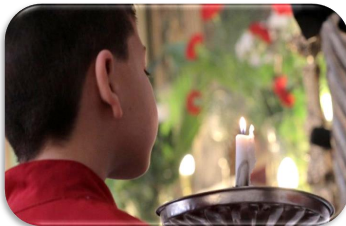
A child lights a candle at a church in Syria

"It is rare nowadays to find an entire family," he told Asia News.