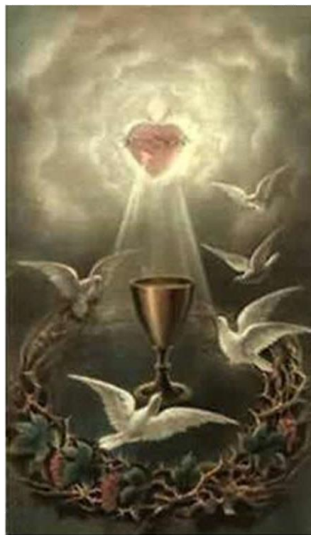
The Holy Sacrifice of the Mass... The Heart of the Church