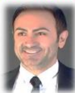
Singer Bassel Eid Sat. & Sun.